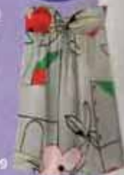
SKIRT, $100. KATIE "FLORAL" SKIRT. LOCAL BREAKS. PRICE $79