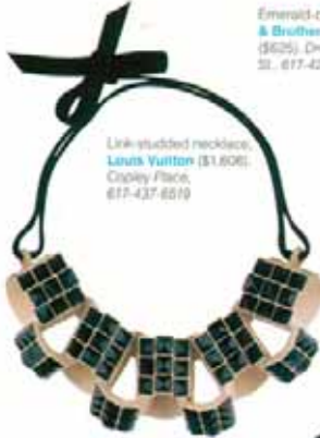
Link-studded necklace, Louis Vuitton ($1,800), Capley Place , 617-437-6819