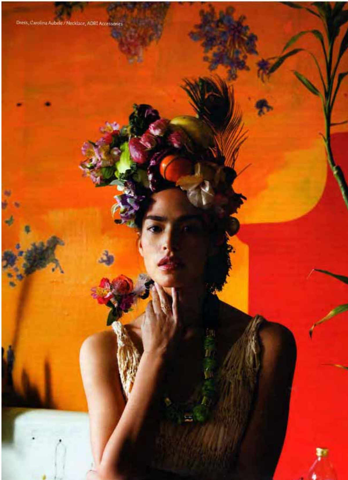
Dress, Carolina Aubele / Necklace, ADRI Accessories