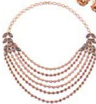
Rose-gold necklace with sapphire, pink opal and pink tourmaline, Irene Neuwirth ($14,800), Barneys New York , Capley Place , 617-385-3300