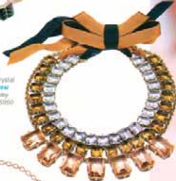
Glamour, Dusty Blossom and Crystal necklaces, J.Crew ($98 each), Capley Place , 617-235-5160