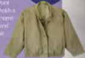
THAYER'S LINEN JACKET, $100. LOCAL BREAKS. PRICE $79